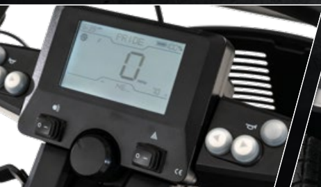
LCD digital display