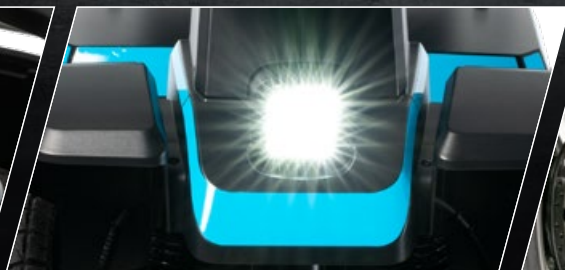
Enhanced LED headlight